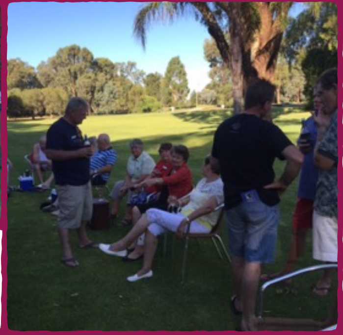
2016 ALDECC REUNION