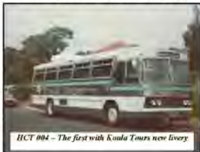
HCT 004 - The first with Koala Tours new livery

Subsequently the company bought Hornsby District Bus Co as well as Pennant Hills-Hornsby Bus Co., Warringah Bus Lines, Griffith's Bus Service, Berowra Coach Services and Talbot's Transport Service, which operated in the Brooklyn area ... and so became the Hornsby Bus Group, although operating as 9 individual company entities.