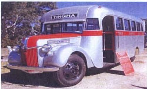
1942 Ford V8 Symes Bus Service Tingha N.S.W.

1942 Ford V8 owned & restored by Symes Bus Service Tingha N.S.W