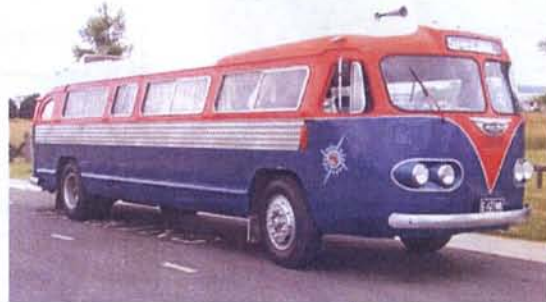
1956 ANSAIR FLEXIBLE CLIPPER

1942 Ford V8 owned & restored by Symes Bus Service Tingha N.S.W