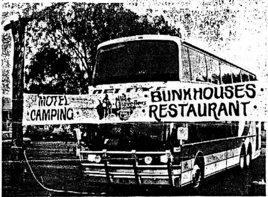
● A bus bursts through the banner to officially open the Alice Travellers Village.

Alice Travellers Village is up and running.